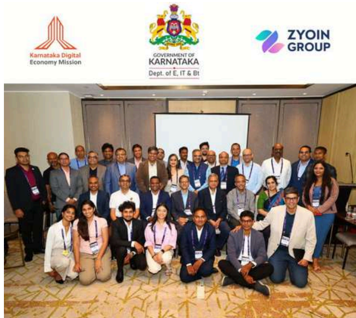
Thank you to the leaders driving ideas, impact, and the future of GCCs

KDEM organized the GCC Leaders Roundtable - Chennai 2026 along with partners ZyoIn Group and Workplace Awards. The roundtable brought together 25+ leaders across aerospace, logistics, fintech, SaaS, and global development to discuss domain expertise, enterprise-wide AI adoption, industry-academia collaboration, and evolving talent strategies.